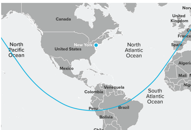
EWR: — BOEING 757-200

SATELLITE WIFI KU BAND Ku-band Systems are the only systems on the market that consistently allows for streaming video and effortless browsing on multiple devices.