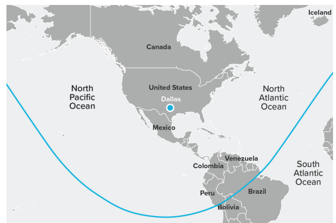
DAL: — BOEING 757-200

Elevate Jet is the exclusive sales and marketing partner for the VIP Boeing 757 fleet, operated under 14CFR121 by New Pacific Airlines AOC# 7C7A855N.